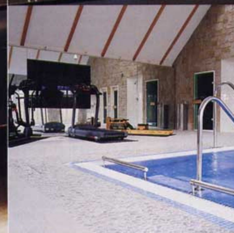
Poolside Panasonic plasma makes swimming more fun