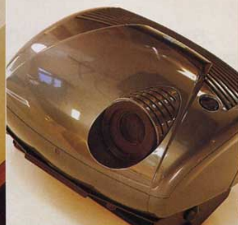
SIM2's projector gives a cinema-like experience at home